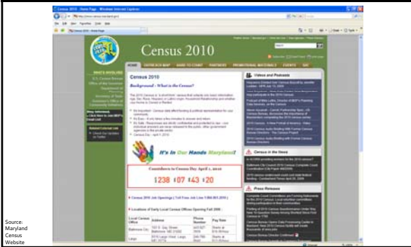
Source: Maryland Census Website